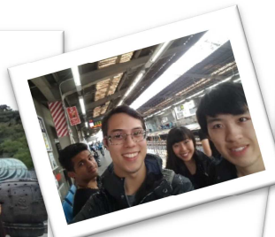
◀▲▲仲間の宮城 ALT たちと〜