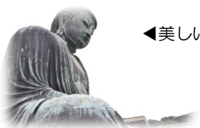
◀美しいお顔立ちの鎌倉大仏〜